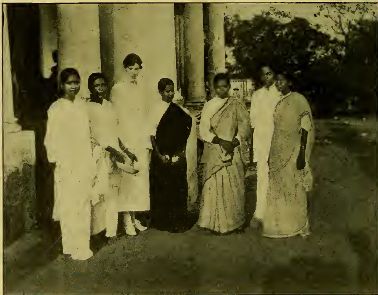
Social Service Workers, Woman's Christian College, Madras